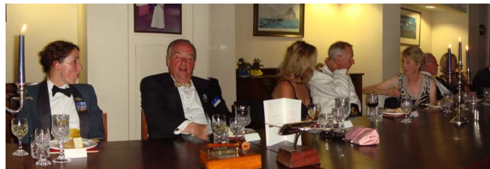
And still she gazed and still her wonder grew

I can't believe that there is any truth in the rumour that the occasional Orderly Sergeant overslept for the flag raising and that a RAF policeman had to be recruited to blow his whistle.