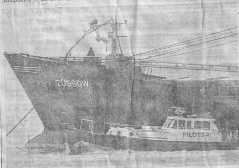
The mast of the Zussow, snapped by the impact.

The survey launches Wyke, Conservancy and Humber Surveyor were concentrating their quest for wreckage using sonar equipment.